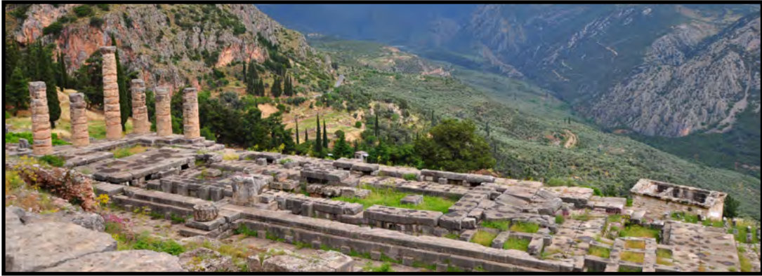
The ruins of the Temple of Apollo at Delphi.

Philosophers of all ages, as far back as the Delphian oracle of the Greek mystery schools, have voiced the admonishment: “Know thyself.” One may wonder: What is so profound about these three simple words? I know who I am. Therein lies the fallacy in most people’s thinking and actions throughout the centuries, excluding the immaterial to exult in the material. Not “who I am” but “what I am” is the key to unlocking the mysteries of existence; for, to know “what I am” is to find the greatest inspiration and happiness of which people, in our finite existences, are capable.